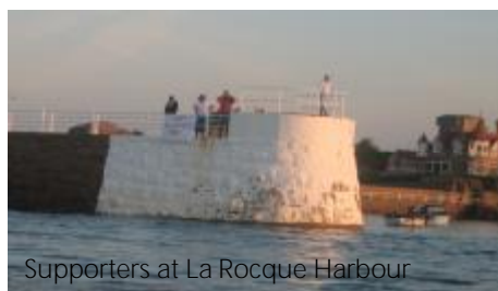
Supporters at La Rocque Harbour