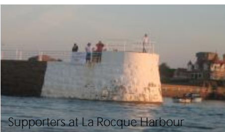
Supporters at La Rocque Harbour